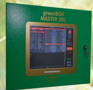
Ecogate Control Panel