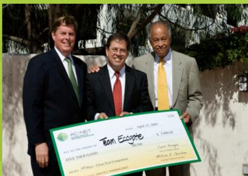
Ecogate receives its $5,000 check for taking third in the 2009 AC-NET competition held at Cal State Fullerton.