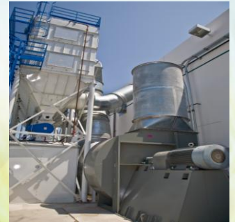
Filter Fan Motor

According to Ecogate’s initial estimates, the greenBOX product could lower RSI’s energy use by 60% by operating RSI’s ventilation system in a “smarter” manner (i.e. only when it’s needed at each work station). And, after just a few months after installation, the actual results indicate a 61% reduction in energy use, which translates into an annual energy bill savings of $200,000!